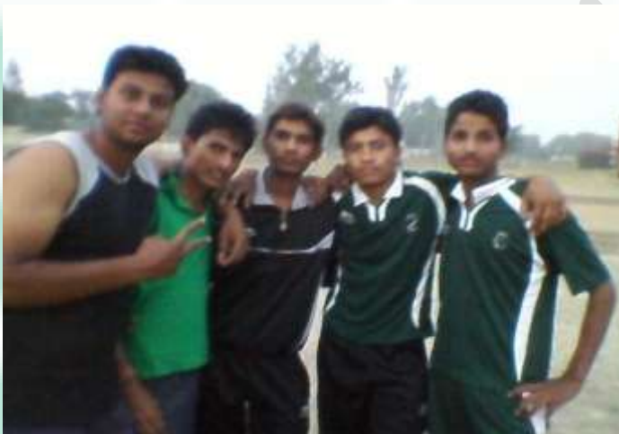
The Handball Team