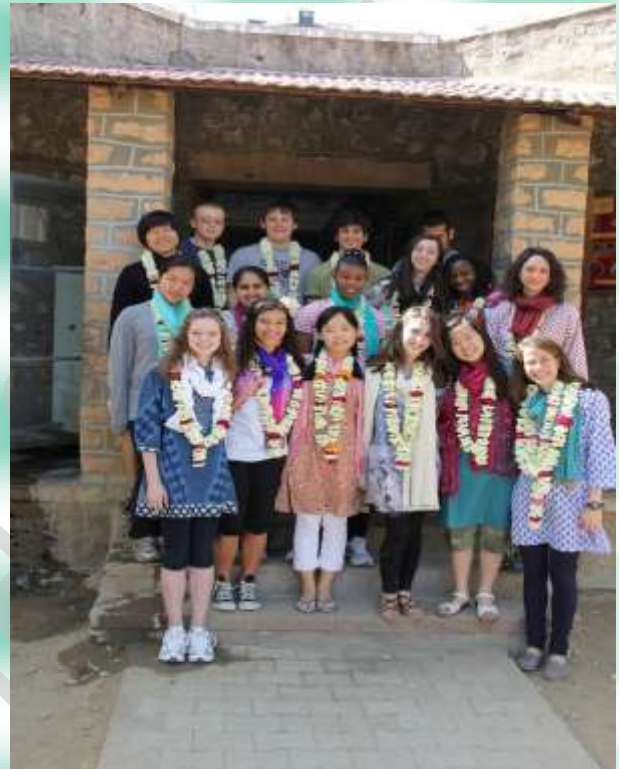
The Loomis Chaffee group

March 2012. After the visit of the two-fabindia girls to LC, sixteen LC students with two teachers visited India and fabindia school this march during their spring break. This was the second year when LC came to fabindia for community service. They helped the school build a proper drinking water system for the students. Their visit to India was for about two weeks where they spent a week in fabindia working with the children and on the project, they also played Holi and loved this Indian Festival Of colors.