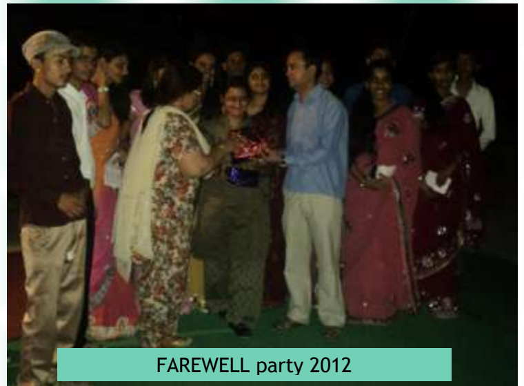
FAREWELL party 2012

April 2012- Saying goodbye is always difficult and sad. Like every year Class XII along with two senior teachers were given farewell on April 13, 2012 while Some new faculty was introduced in this big Family.