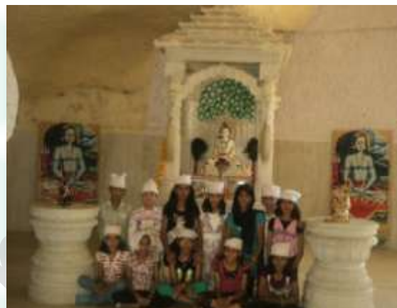
Children' day trip to daantiwada for junior students.