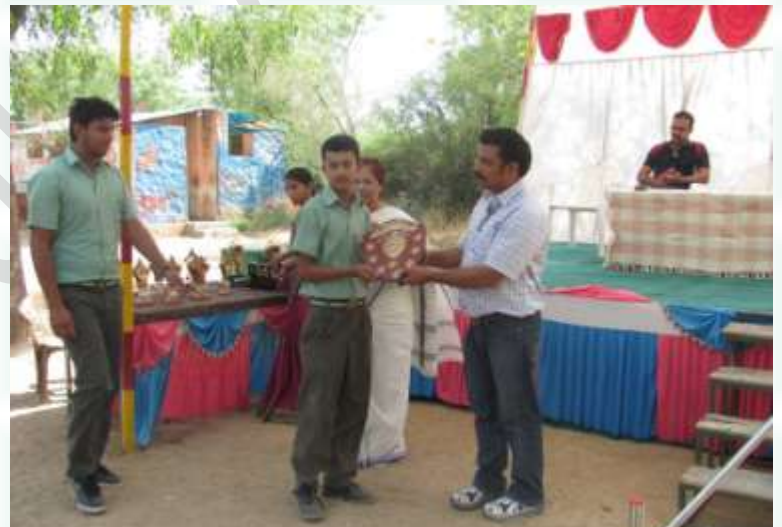
Our guest presenting awards to students: prize distribution ceremony

April 2012. The prize distribution ceremony that was to be held on 10 February 2012 along with the annual function took place on 13 th April 2012. Selected students, faculty and Student Council were awarded for their outstanding performance for the year 2011-12.