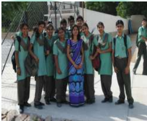
Senior students on an educational trip to JADAN.