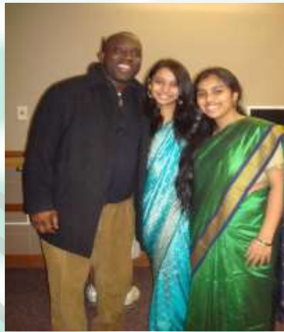
Representing India and Fabindia in United States.