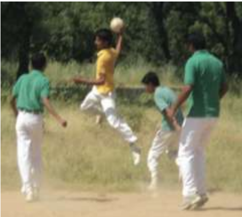
Handballs match being played by the students.