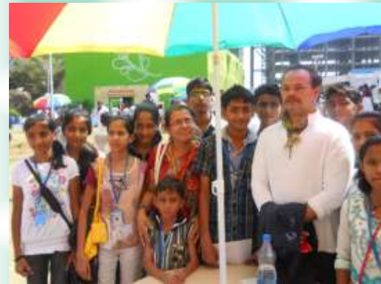
Students in international children's film festival at Hyderabad