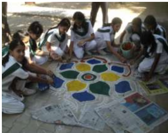
Girls participating in Rangoli making competition