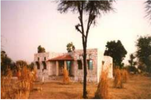
School back in 1992

Dear friends, this year Fabindia is officially celebrating its 20 th birthday. Being one among the best English medium schools in the area, it has successfully entered into a new decade. The school has come a long way since its inception in 1992 from the first batch of 11 students; to almost 1000 students from pre-school to class XII with 40% female population.