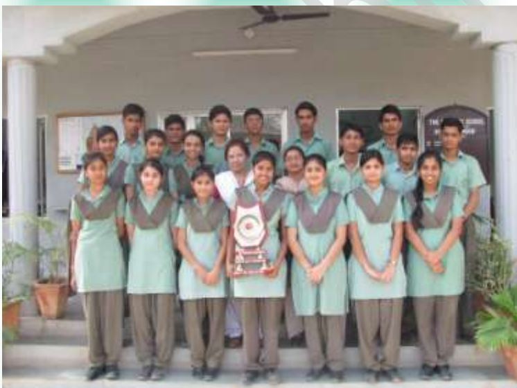
Trophy given to former Class X for their 100% result in board examinations under the CCE scheme.