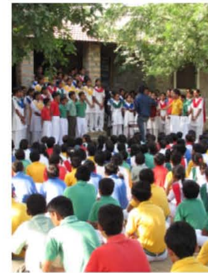
A School Assembly on a House Colour Day