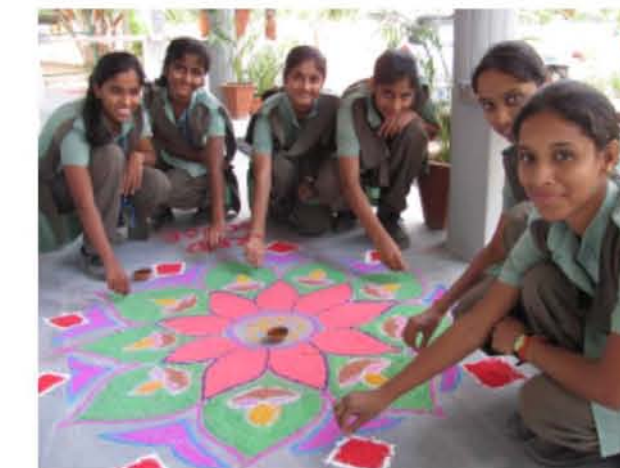
Fabindia Girls doing Rangoli on the occasion of Diwali