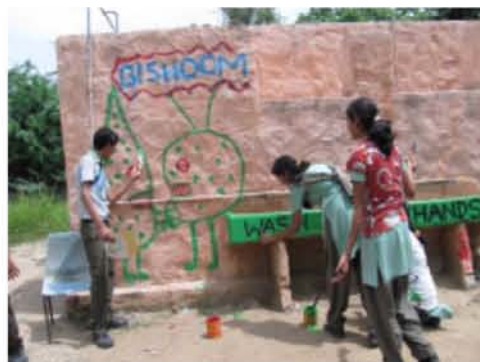
Senior Students Paint Toilet Wall with Different Health Captions