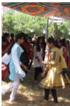
Dancing Along with the Teachers

The students successfully competed in three inter-school competitions and took home several awards, including first place in the inter-school handball and marching competitions and second place in the inter-school singing competition. They are busy with sports, drama, arts and crafts, music and various class projects, including a spectacular Egyptian civilization exhibition which the Secondary School students completed for their Social Science class.