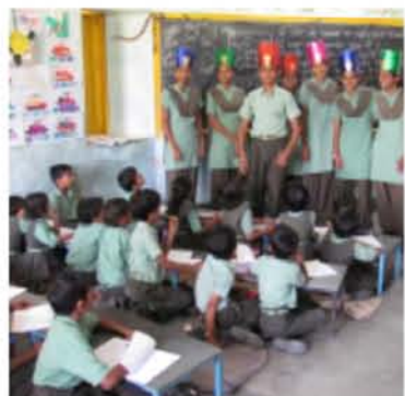
Senior Students do a Presentation to the Lower School on Egyptian Pharaohs