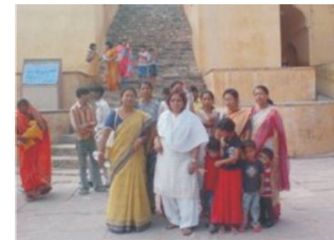
Educational Field Trip to Himalayas