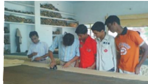
Field Trip to Fabindia Block Printing Unit near Jaipur