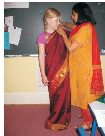
Dressing Up For India Festival at Advent School

After visiting The Fabindia School during their winter break in December 2006, two teachers at the Advent School took the experiences from their trip to create an Indian Festival back home in Boston, sharing what they learned on their trip. The teachers brought back henna for mehndi designs, clothing, lanterns, bindis, spices and more that the students used in their presentation. The fifth graders dressed up in Saris and Indian clothing and did a school wide presentation to parents and the other students. After watching a video of the Fabindia students performing a dance program, the Advent students decided to make their own video, and recorded songs and dances which they sent back to the Fabindia School students.