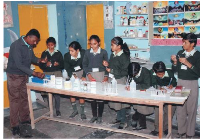
Science Lab at The Fabindia School

Published by The Fabindia School for The John Bissell Scholars Fund