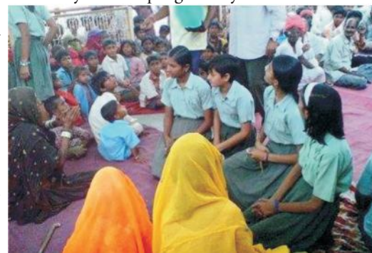
Senior Girls discuss the Literacy Program at nearby village

The students and school teachers will continue to conduct literacy programs at the school's "adopted" village every 15 days throughout the school year. As a first time community service program by the students and teachers of The Fabindia School, everyone was overwhelmed by the positive results.