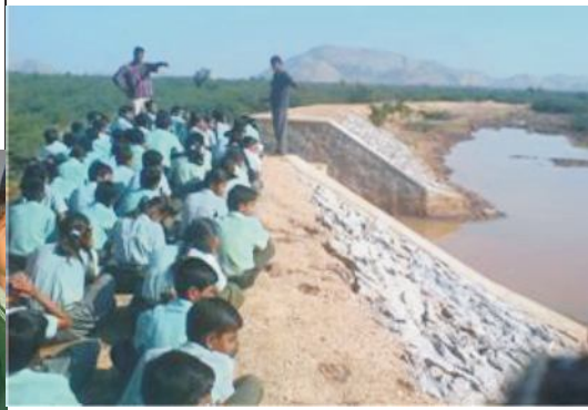
Field Trip to Local Water Conservation Project