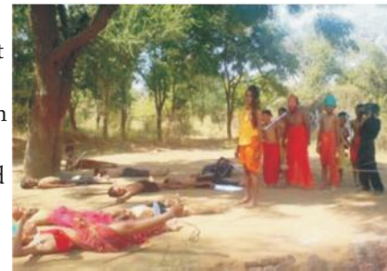
Students stage play under the trees

A play on 'Ramayana' was put up by the students of Junior School on the occasion of 'Diwali'. They acted brilliantly and proved their acting mettle.