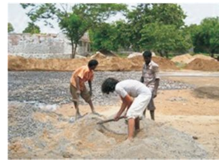
Putney Students Help Build New Basketball Court

They built a Basket Ball Court and did Roofing of the outdoor student toilets. They taught in Junior School, conducted morning assemblies, put up plays, and played matches with school teams. They waded through the flooded roads and completed all the Projects. We are very thankful to them.