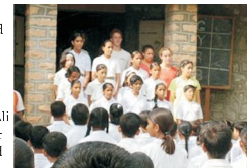
Putney students lead Morning Assembly