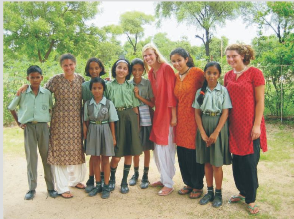
Putney Student Volunteers with Fabindia School Students

I learned a little Hindi while interacting with the kids we taught and the locals we talked to, and I loved shopping for things and observing how everyone lives on a normal day. Along with all that, the historical sites we were able to see just blew my mind and it gave me a great perspective on how every