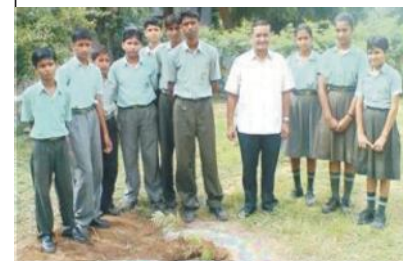
Annual Day to Plant Trees