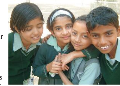
Good Friends at The Fabindia School

Two days later, during our visit to the school, I couldn't help but feel the contrast. Sixth grade girls, my daughter's age, this girl's age, were an animated presence in the classroom. They raised their hands to speak in class; they greeted us in a poised and capable manner, their long legs raced out of the classroom to prepare for the performance. And what a performance! Grinning, green-uniformed girls were transformed into traditional Rajasthani dancers. These were girls who showed respect for their culture and traditions but had a clear sense of the larger world around them.