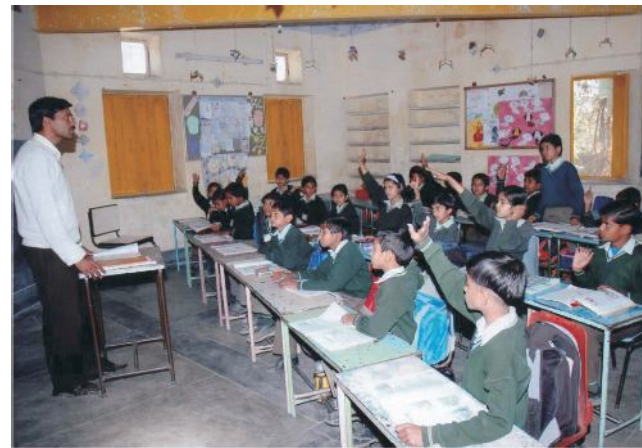
A view of a classroom at The Fabindia School