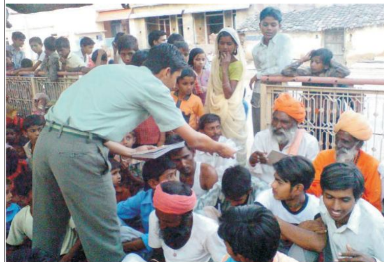
Senior Fabindia student distributes free reading material

In April 2007, 30 students at The Fabindia School from grades 8-10 adopted a nearby village, Punaria, to lead an Adult Literacy program. In addition to reading and writing, the students also addressed the gathering on the importance of sanitation and the environment. Many girls spoke on the importance of education in their lives and encouraged the adults to learn reading and writing. At the end of the program, one of the women held a girl's hand and said: "You are literate, so you have courage to speak in front of so many people. Look at us, how far behind we are left. Today I pledge to learn how to read and write my name."