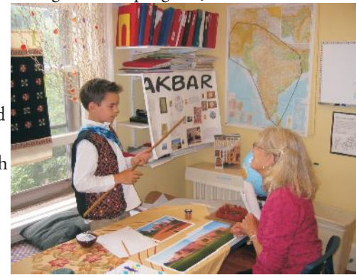
Advent Fifth Grade Student Teaching a Parent About India

After visiting The Fabindia School during their winter break in December 2006, two teachers at the Advent School took the experiences from their trip to create an Indian Festival back home in Boston, sharing what they learned on their trip. The teachers brought back henna for mehndi designs, clothing, lanterns, bindis, spices and more that the students used in their presentation. The fifth graders dressed up in Saris and Indian clothing and did a school wide presentation to parents and the other students. After watching a video of the Fabindia students performing a dance program, the Advent students decided to make their own video, and recorded songs and dances which they sent back to the Fabindia School students.