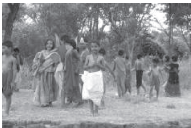
A scene from the Ramayana enacted by the students