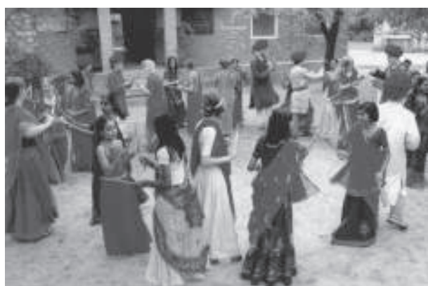
'Garba' dance performance by Putney and Fabindia students