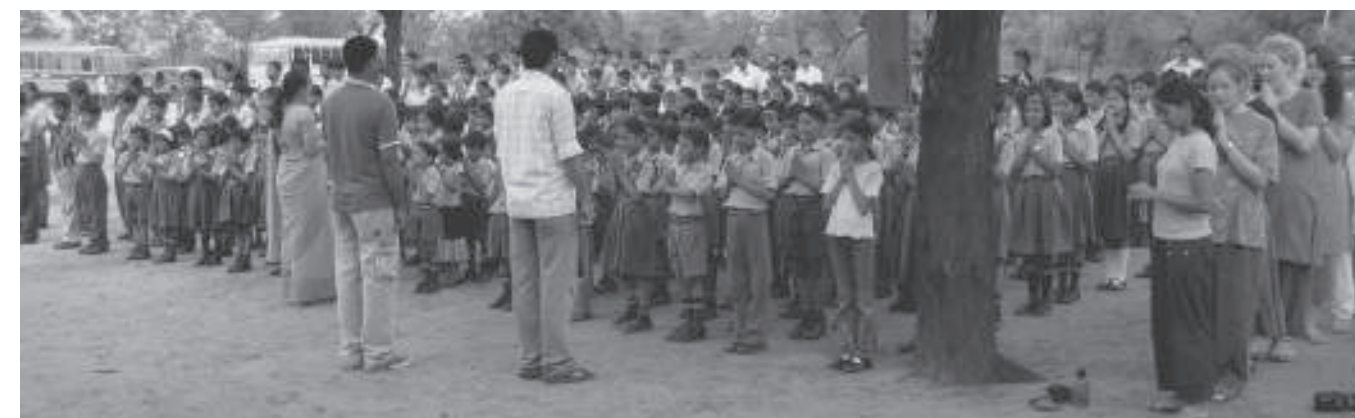
Putney Students attend the morning assembly at The Fabindia School.