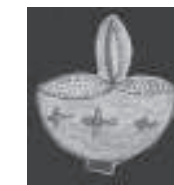
A Diwali decoration from a class II student

A wonderful heaven is my school Sweet school, beauty school, lovely school Teacher love me, friends love me I love too. A wonderful heaven is my school.