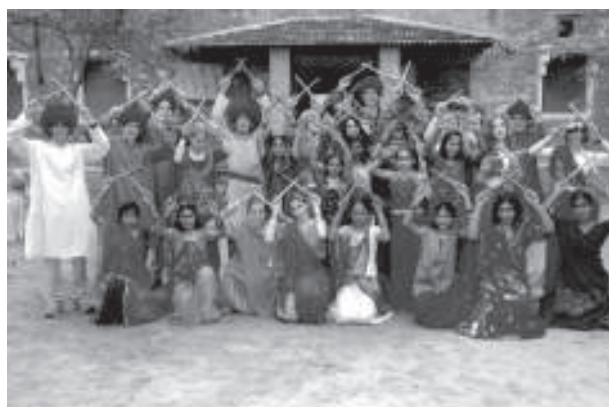
Putney students participating in a carnival on their last day at The Fabindia School